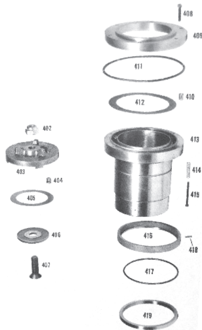
MODELS 330 & 340 VMC